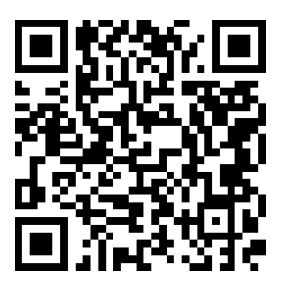
Scan to watch crash test video