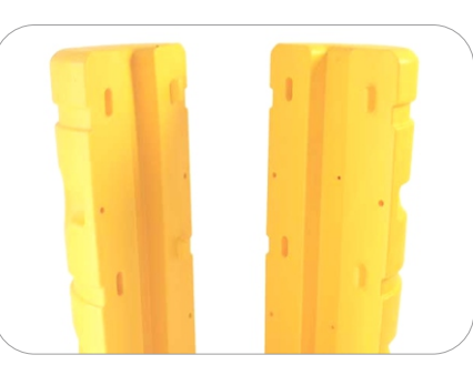
Consisting of 2 semicircles for easy installation