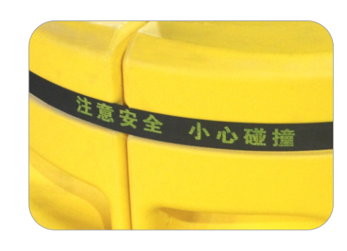
Black belt printable warning