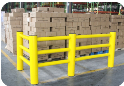
Installed in 90°

Crossbar has a reflective effect at night