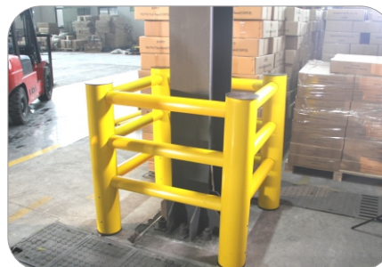
Used in combination and protect columns.