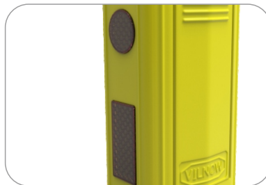
Signal quickly within 9 meters

Built-in large battery, working continuously before running out of power