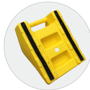
Rubber pad, with better skid-resistance.