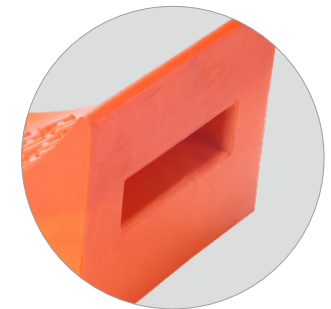
Handle design, easy to carry.